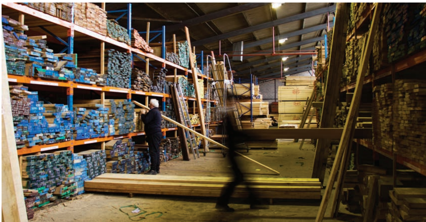
Well organised racking means customers may enter and select their own timber.

builders, luthiers and passionate hobbyist woodworkers alike all make use of the extensive stock and preparatory machining services.