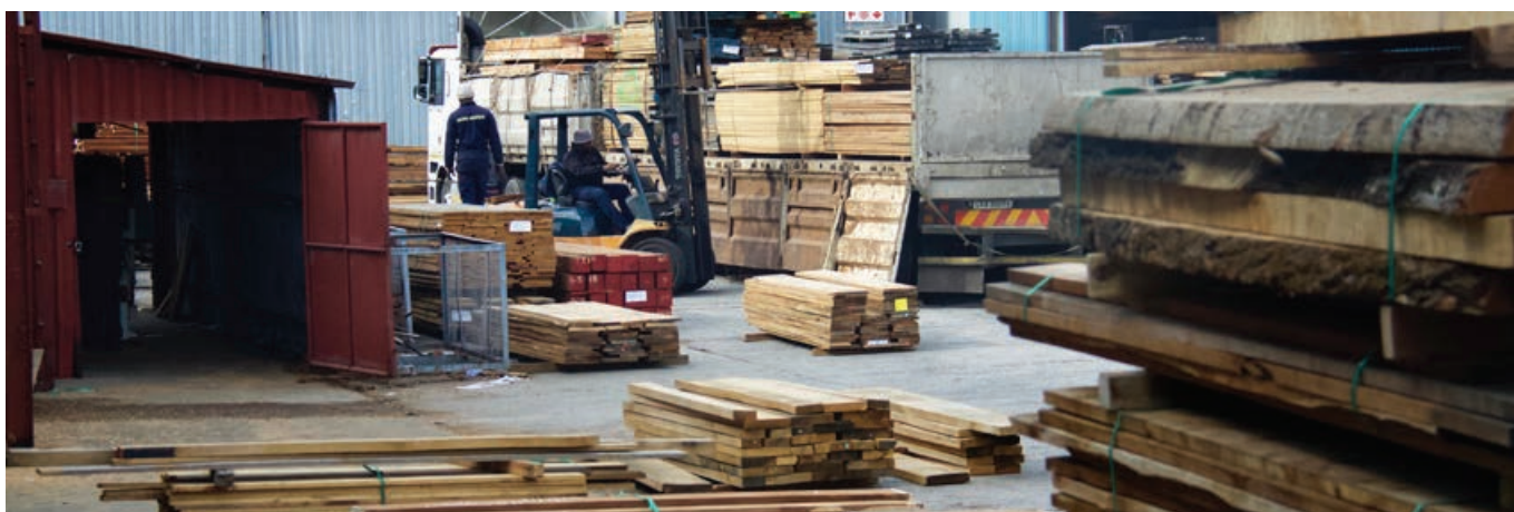
There is always plenty of action at the Rare Woods yard.