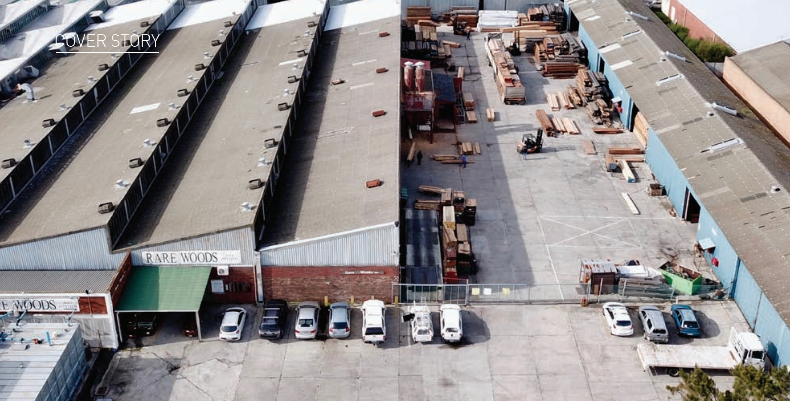
Rare Woods' extensive facilities are home to an enormous stockholding of exotic timber.