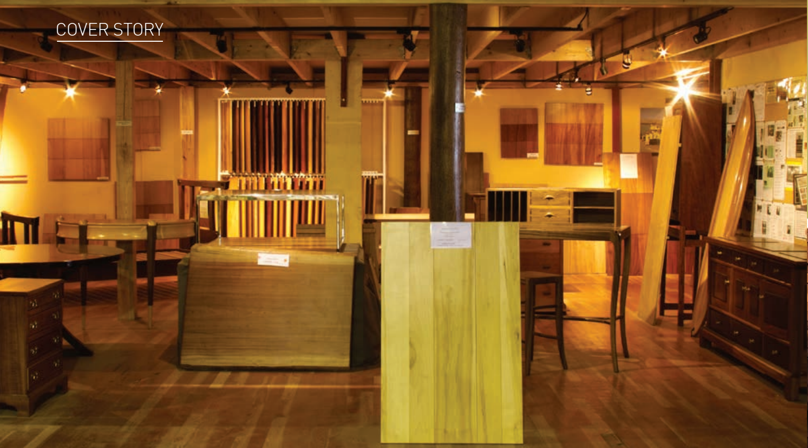
Big showrooms create a welcoming environment for timber lovers.